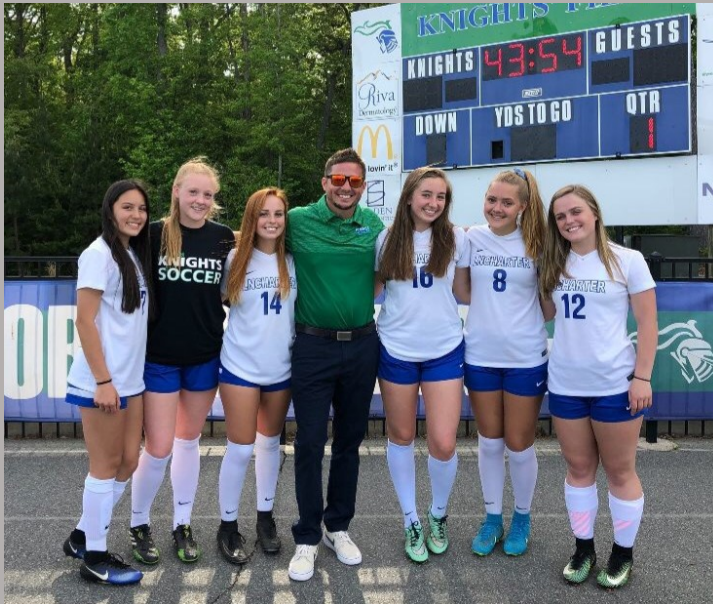
Congratulations to the seniors of the Lady Knights' soccer team on a perfect conference season!