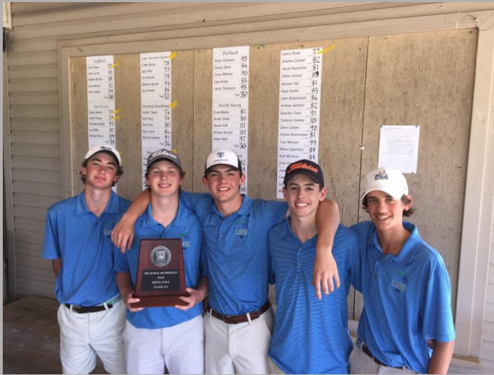
Congratulations to the HS golf team, who are headed to States!